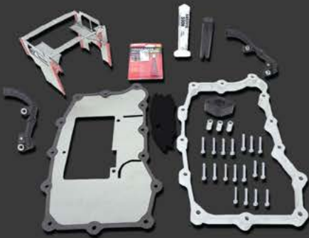
DEEP SUMP KITS