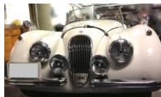
1954 Jaguar XK 120 28K mi, Matching #s $106,000