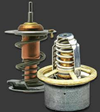
ENGINE AND TRANS COOLING

CHECK OUT ALL OUR PERFORMANCE AND RELIABILITY SOLUTIONS