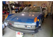
1969 914 1.7 Project Car, Quite Solid $6,000 or offer

Porsche 991 S Sport Techno Wheels 16K miles 2 – 8 ½ x 20 2 – 11 x 20 $2,500 or offer