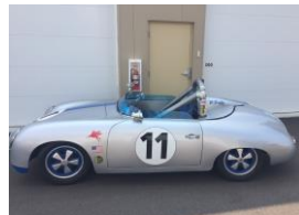
1957 Porsche Speedster Vintage Race/Outlaw $210,000