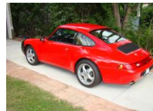
1996 993 C2 COUPE 32K mi. 6-speed $65,000 or offer