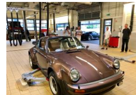
1975 930 Turbo #55 Built; Collectible! $340,000