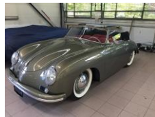
1955 Pre A Continental Cab #s Matching/1 of 50 $325,000