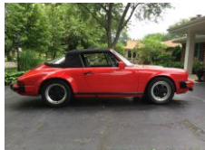
1983 911 SC Cab 19k mi. Stock $54,000 or offer.