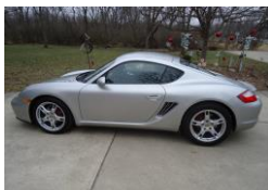
2008 Porsche Cayman 29K miles, 5-speed manual $23,500