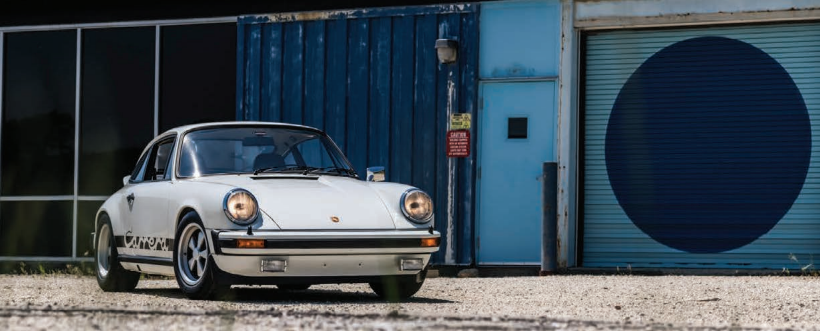
1974 2.7 Euro MFI Carrera Restored by Barnaba Autosport