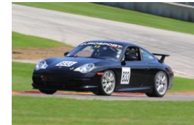
2004 Porsche GT3 Racer PCA Racing/Track days $50,000 or offer