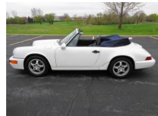
1992 Porsche 964 C2 Cab 2-owners, matching #s $44,000 or offer