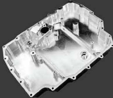
BILLET 9A1 DEEP AND 9A2 SUMPS