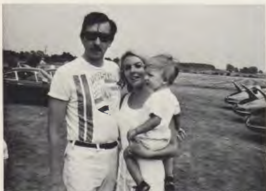
You better watch those transfer students