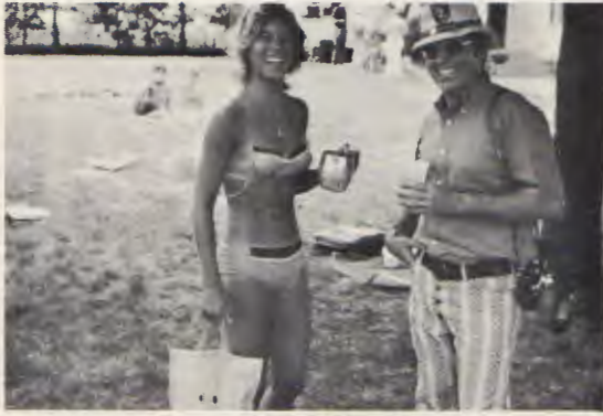
Transfer student scores again