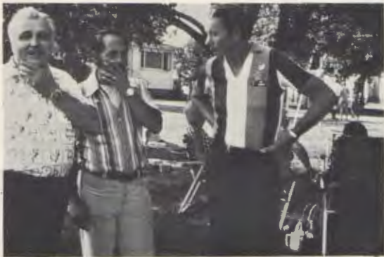
914/8? ...I don't believe it!