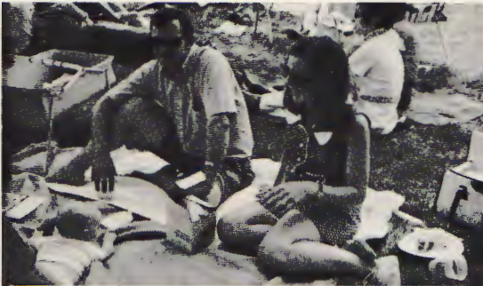
A quiet day in the country