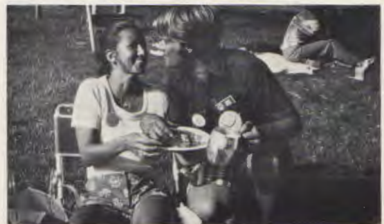
Frickette and Frack.... Again?