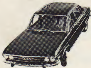
The Audi 100LS