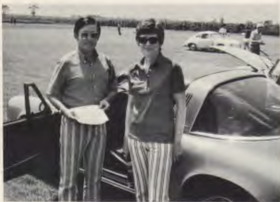
Transfer student scores