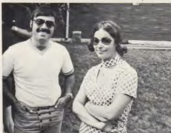
Well.....just thought I'd ask