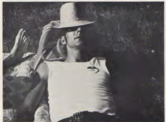
I'm OK...Get me another beer.