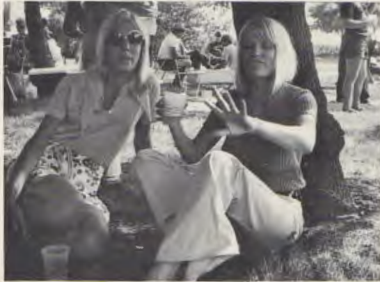
Steady as a rock!