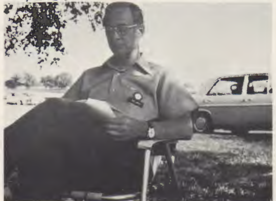
Why is this man smiling?