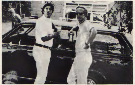
Did you say passion?