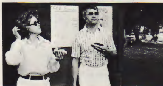
You promised me Chateaubriand"