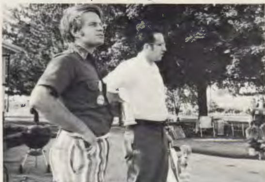
Assistant and Chairman...worried