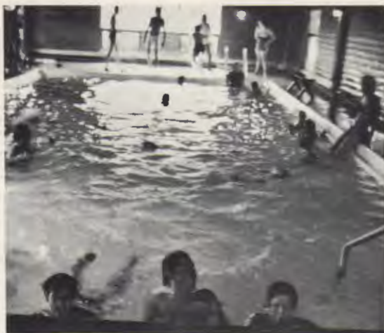
"Ole swimmin hole"