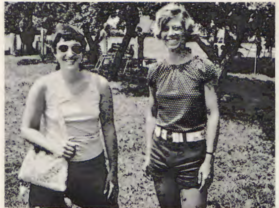
Well Bonnie, I don't think he's so cute!