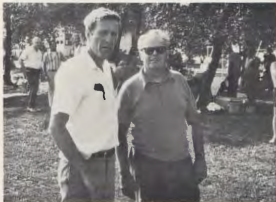
Dammit, second place again!