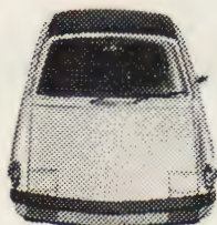
The Porsche 914