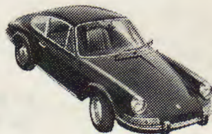
The Porsche 911