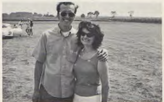
Picnics are fun