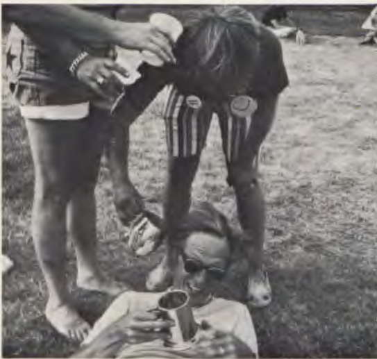
DON'T...I'll drink it